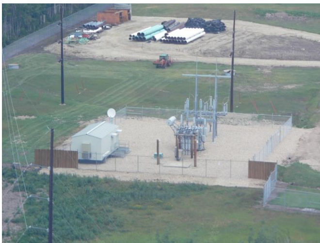
The existing Gainford Substation is pictured above.

During construction, a mobile substation may be used to maintain electrical service and reliability at the substation. If required, it may be located outside the substation fence and will remain within AltaLink’s leased boundaries.