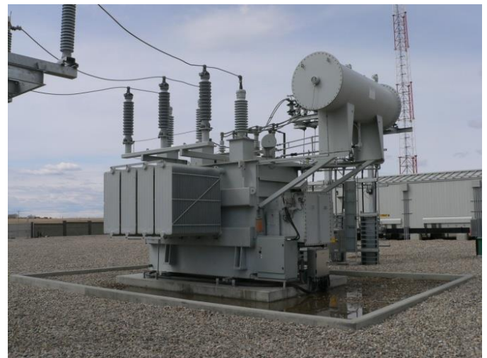
A typical transformer is pictured above.